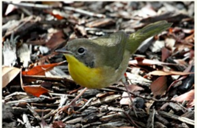
Common Yellowthroat, Hermann Park 10/10/11