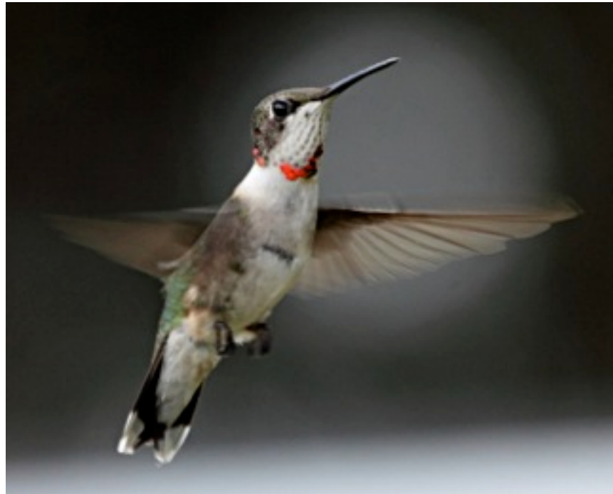
Ruby-throated Hummingbird Brazos Bend State Park 9/28/11

TEXANS, YOUR BACKYARD BIRD COUNT DID US PROUD!