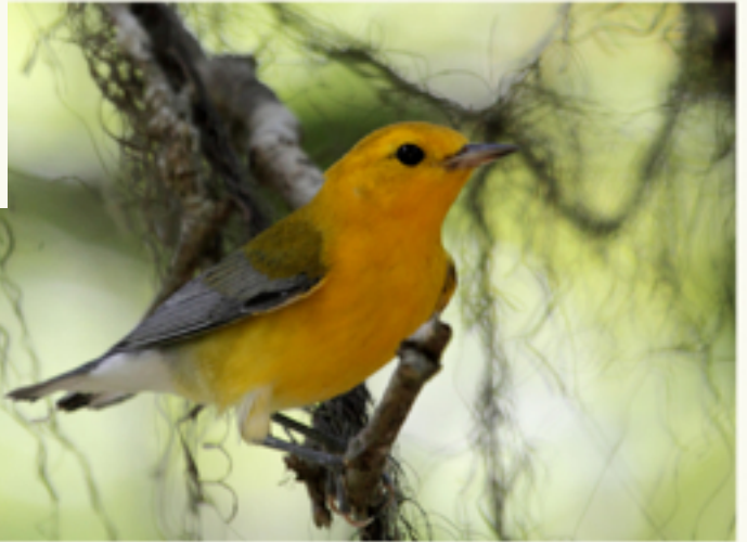
Prothonotary Warbler, Brazos Bend SP, 8/23/12