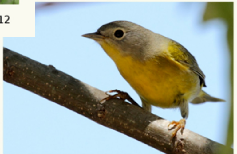
Nashville Warbler, Brazos Bend SP 9/28/11