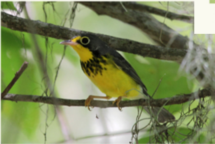
Canada Warbler, Brazos Bend SP, 8/23/12