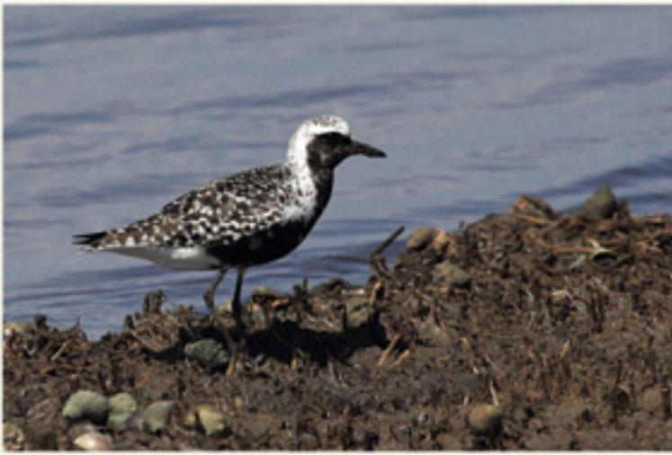
Black-bellied Plover, Galveston East Beach, 8/9/12